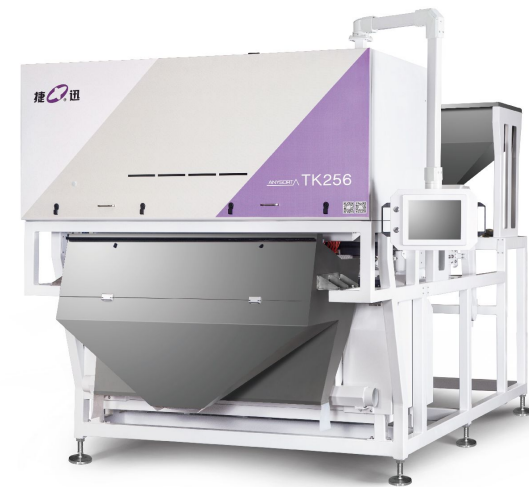
Peanut Color Sorter

Scan to Follow Our Official WeChat Account